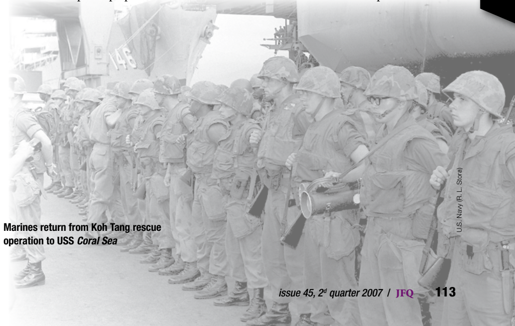
Marines return from Koh Tang rescue operation to USS Coral Sea

The landings on the western beach were not as bad but still were no picnic. The opposition was so fierce that Colonel Austin's command group was not landed on the proper beach but many yards to the south and out of contact with the main group. After several approaches, the choppers were able to offload their Marines safely. Another helicopter was lost in this operation. It took heavy fire but was able to fly away from the beach a bit, and the pilot ditched the helicopter at sea. Part of the crew was rescued. No one at Koh Tang had any knowledge that the Mayaguez crew had already been released. Austin still thought that his mission was to sweep the island to find the crew, but his isolated position and